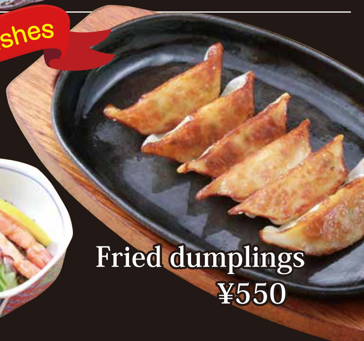
Fried dumplings ¥550