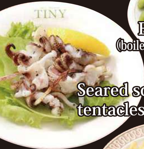
Seared squid tentacles (salt) ¥550