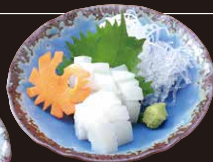
Squid sashimi ¥720