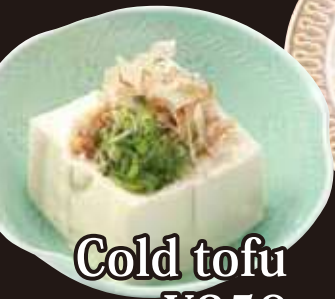
Cold tofu ¥350