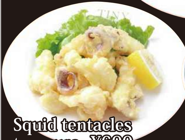
Squid tentacles tempura ¥600