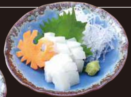
Squid sashimi ¥700