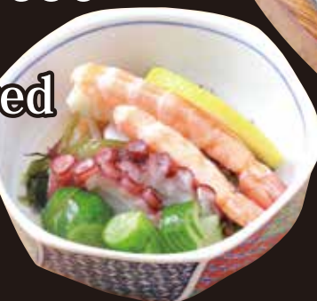
Vinegared seafood ¥700