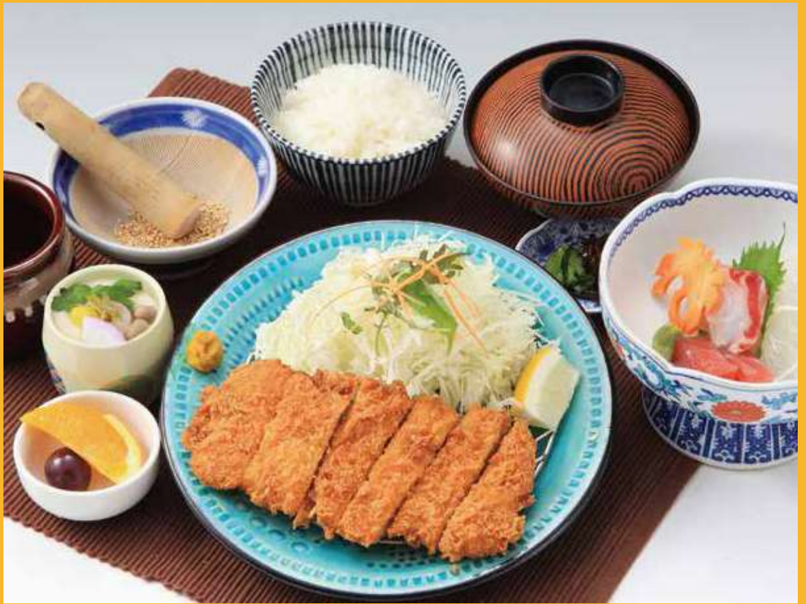
Sera katsu gozen ¥2,100

"Setouchi Rokkokuton" is produced at four farms in the prefecture, including Sera Kogen, based on the HACCP production system recommended by Hiroshima Prefecture, and is raised on feed consisting mainly of six kinds of grains (corn, milo, rice, barley, wheat, and soybeans), which gives the pork a sweet, light aftertaste. (※Sera Kogen Pork is the pork raised on a farm in Sera among the "Setouchi Rokkokuton".)