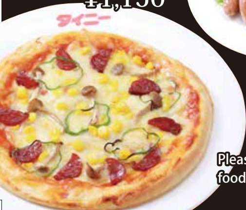
Homemade pizza ¥1,150