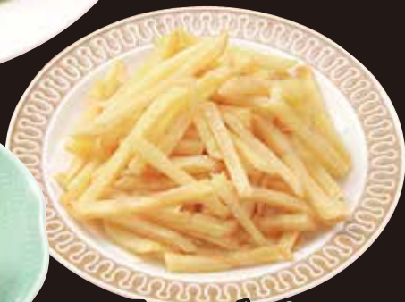
French fries ¥420