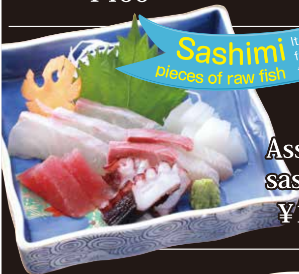
Assorted sashimi ¥1,750