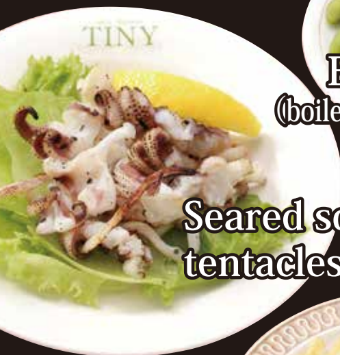
Seared squid tentacles (salt) ¥600