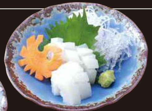
Squid sashimi ¥700