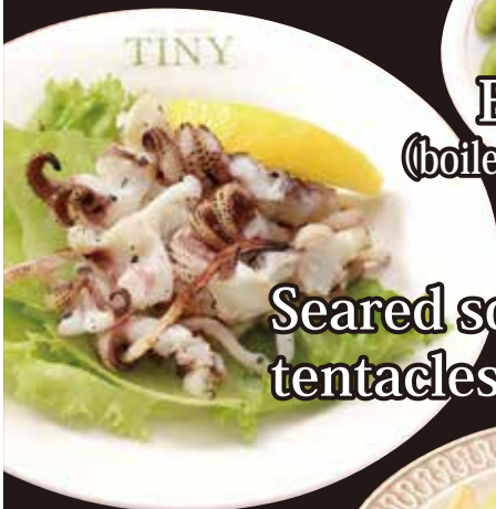
Seared squid tentacles (salt) ¥600