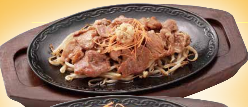
Pork stir fry with ginger ¥850 Pork stir fry with ginger WA set meal ¥1,200