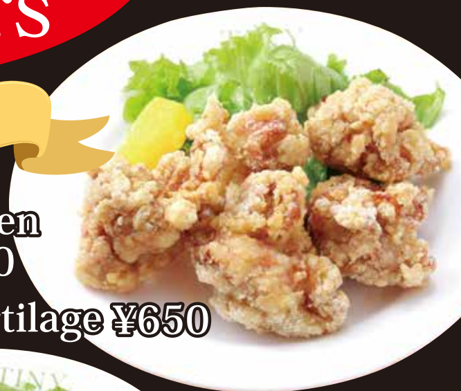
Fried cartilage ¥650