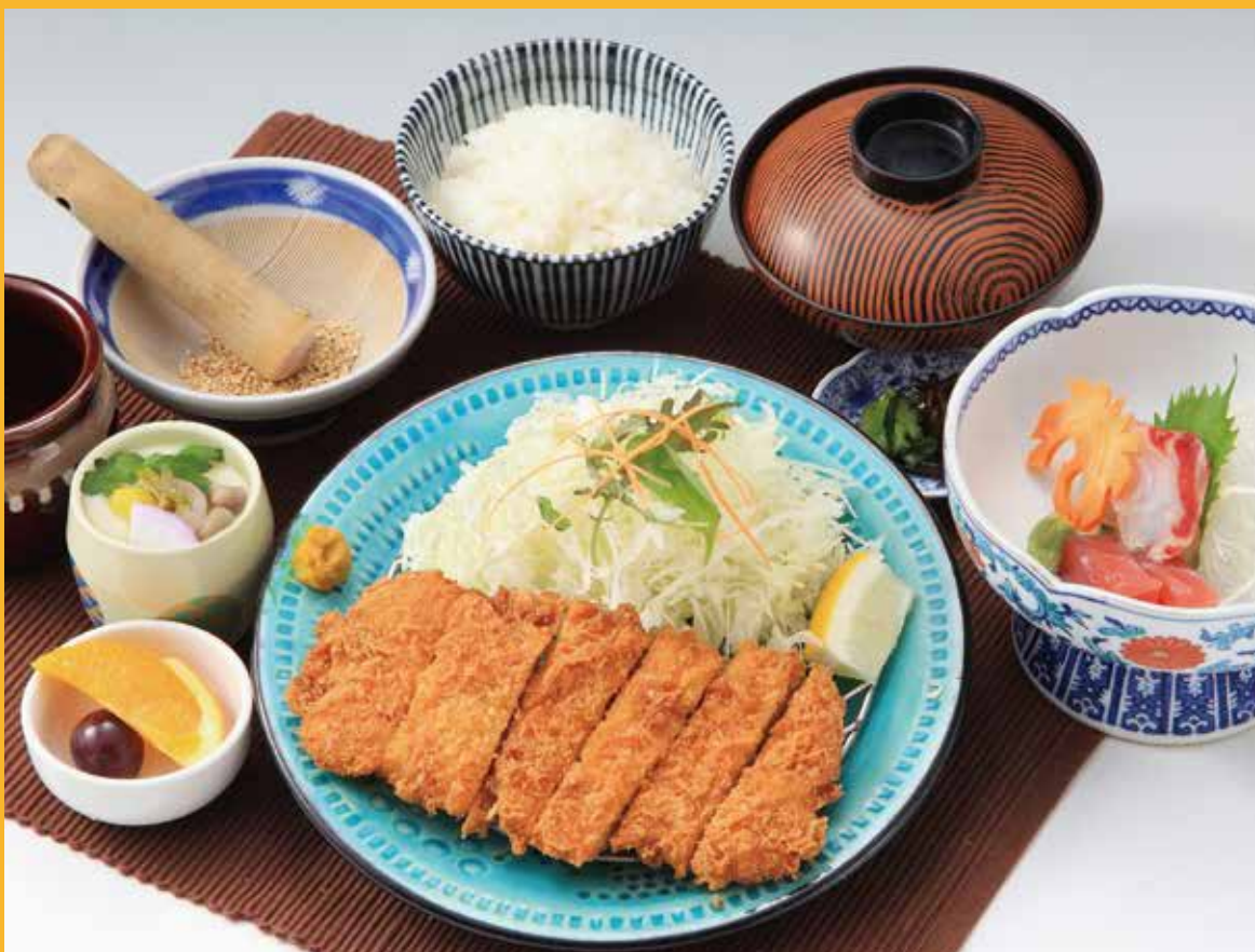
Sera katsu gozen ¥2,300

Pork cutlet sashimi steamed egg custard rice miso soup pickles dessert