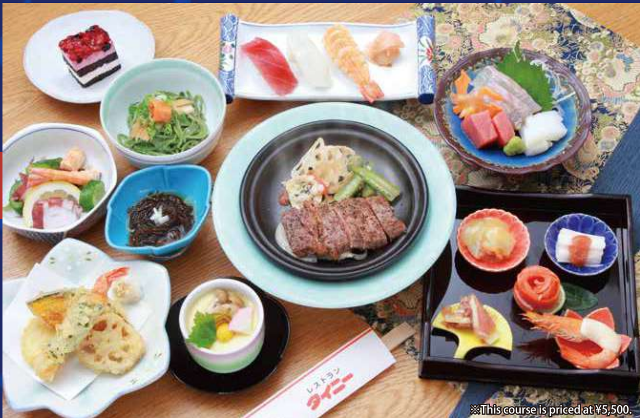
※This course is priced at ¥5,500.