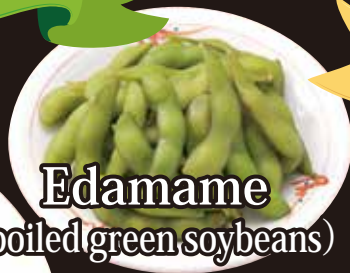
Edamame (boiled green soybeans) ¥400