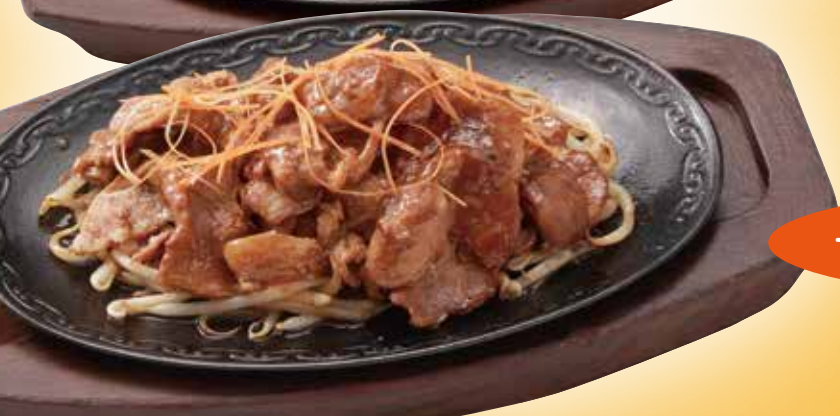
Pork stir fry with miso ¥850 Pork stir fry with miso WA set meal ¥1,200