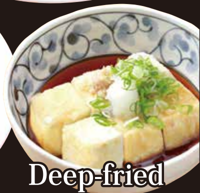
Deep-fried tofu ¥450