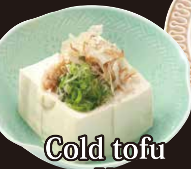
Cold tofu ¥400