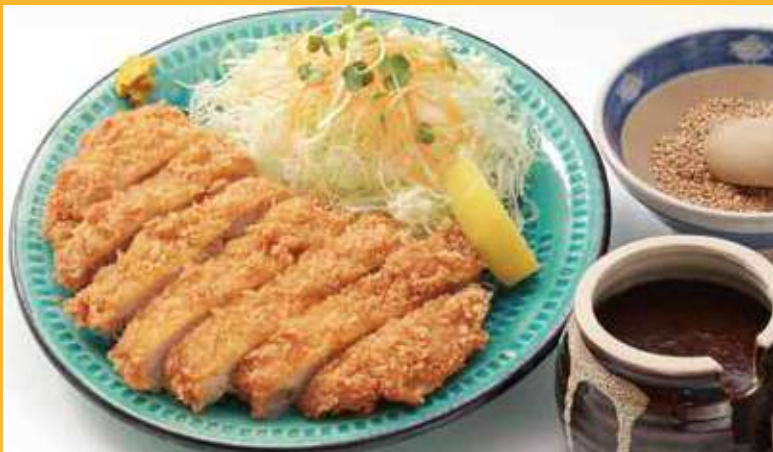
Pork cutlet ¥950 Pork cutlet set meal 1,240