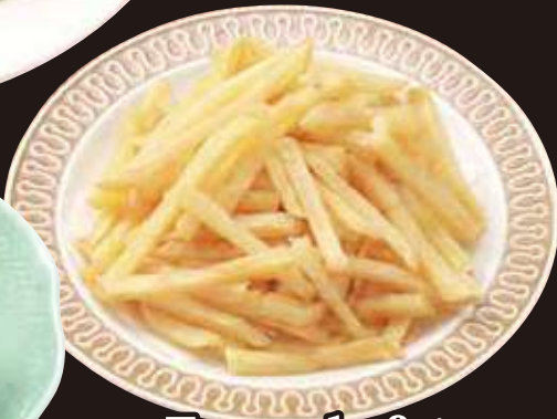
French fries ¥380