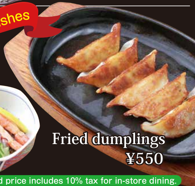
Fried dumplings ¥550

Please ask the waiter for food allergy information.