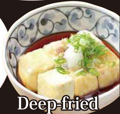
Deep-fried tofu ¥430