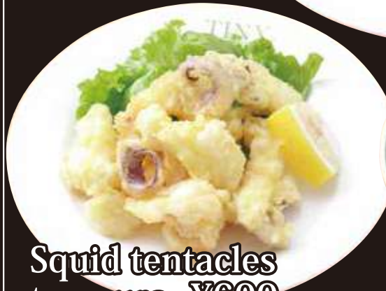
Squid tentacles tempura ¥600

It is made mainly from fish directly from Itozaki Fishing Port.