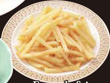
French fries ¥380