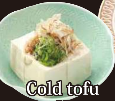
Cold tofu ¥350