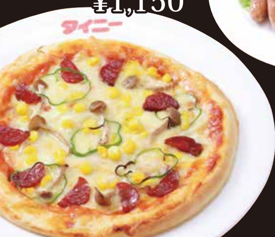
Homemade pizza ¥1,150