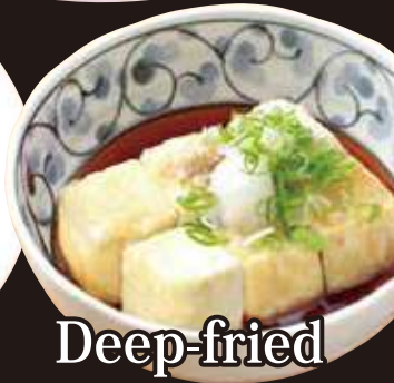
Deep-fried tofu ¥430