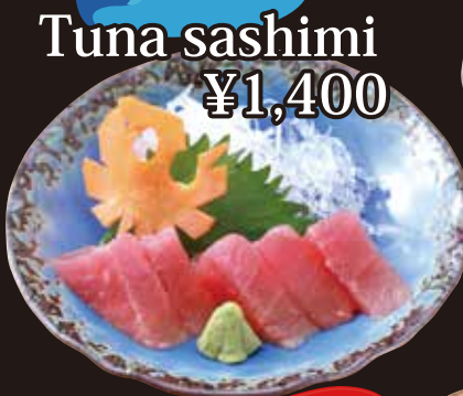
Tuna sashimi ¥1,400

It is made mainly from fish directly from Itozaki Fishing Port.