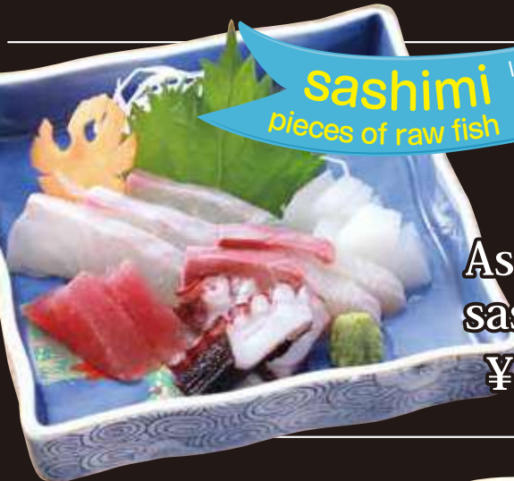
Assorted sashimi ¥1,700