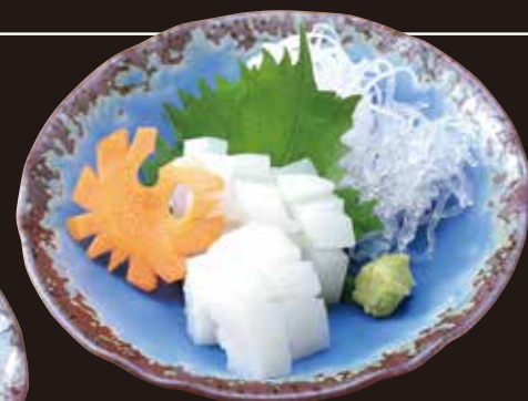
Squid sashimi ¥720