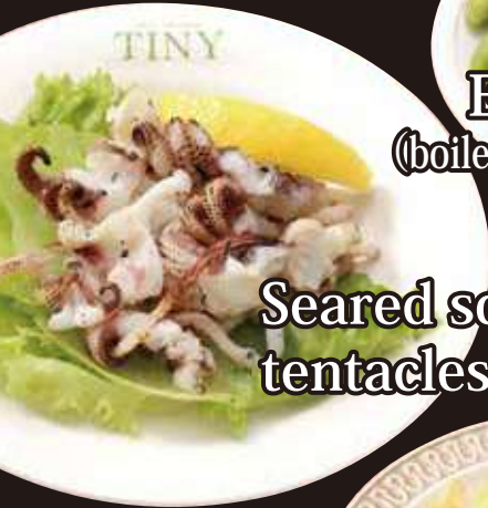
Seared squid tentacles (salt) ¥550