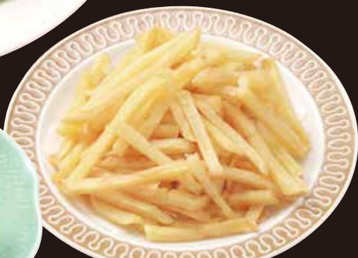
French fries ¥420