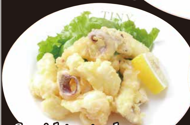
Squid tentacles tempura ¥650