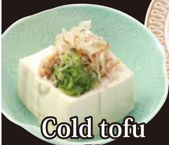
Cold tofu ¥400