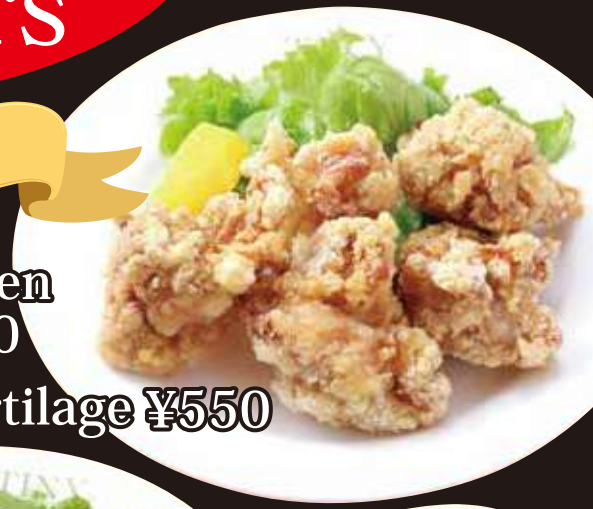
Fried chicken ¥610

The displayed price includes 10% tax for in-store dining.