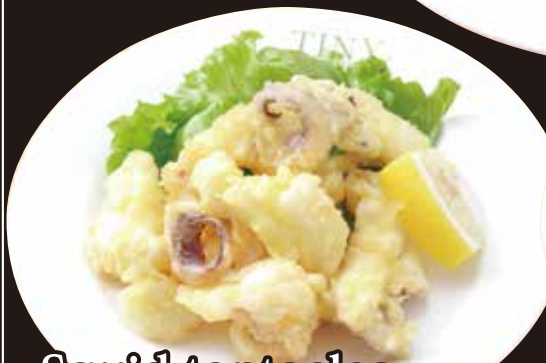
Squid tentacles tempura ¥650