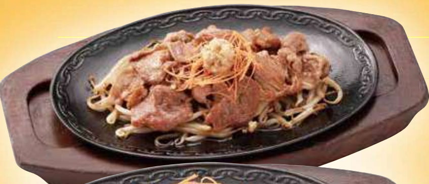
Pork stir fry with ginger ¥650 Pork stir fry with ginger WA set meal ¥1,000