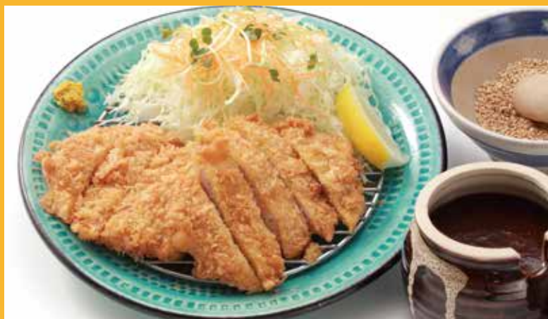
Pork fillet cutlet ¥1,250 Pork fillet cutlet set meal ¥1,550