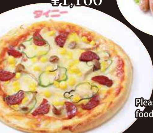
Homemade pizza ¥1,100