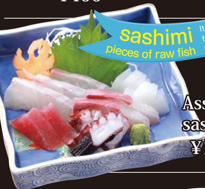
Assorted sashimi ¥1,750