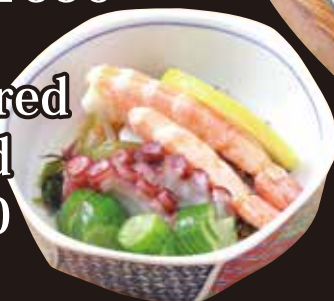
Vinegared seafood ¥700