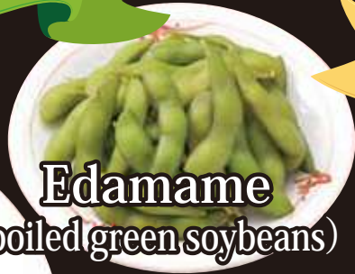
Edamame (boiled green soybeans) ¥350