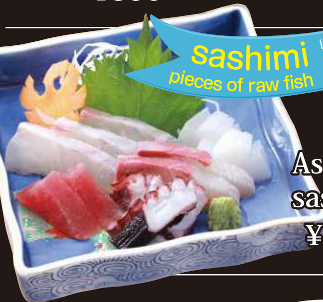
Assorted sashimi ¥1,700