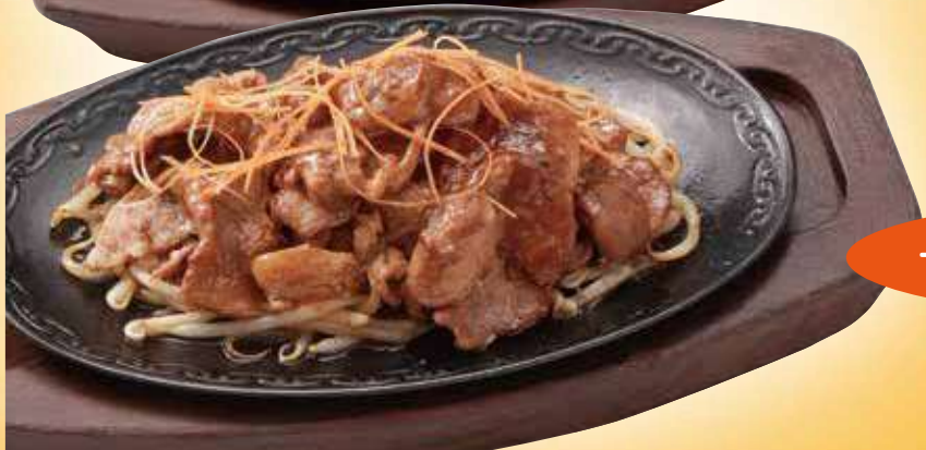
Pork stir fry with miso ¥650 Pork stir fry with miso WA set meal ¥1,000