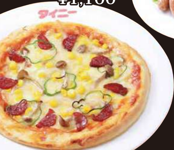
Homemade pizza ¥1,100