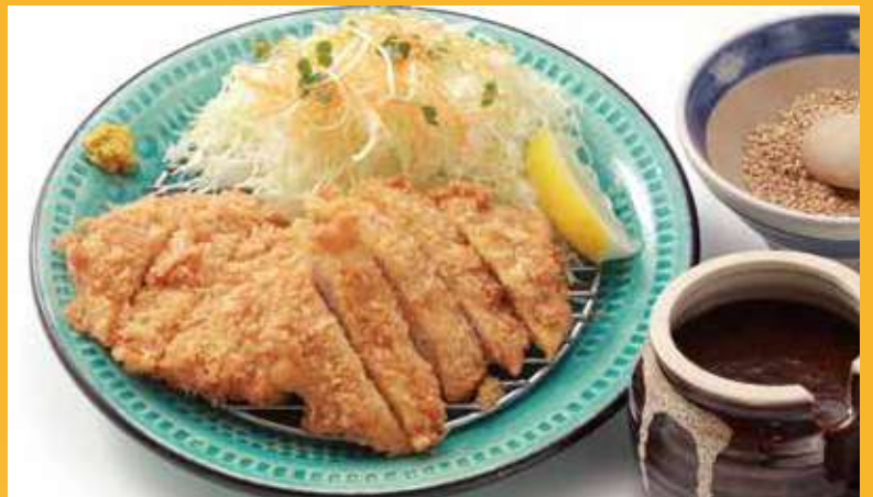
Pork fillet cutlet ¥1,100 Pork fillet cutlet set meal ¥1,390