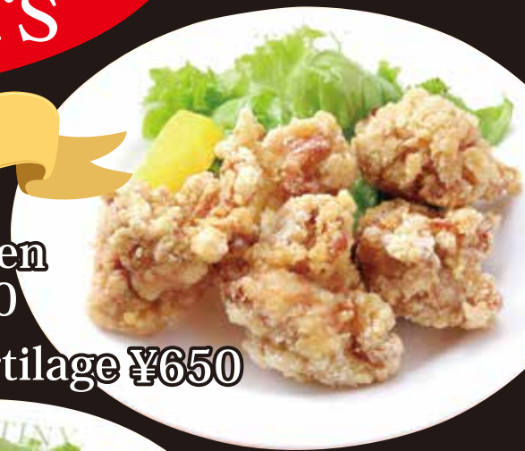
Fried cartilage ¥650