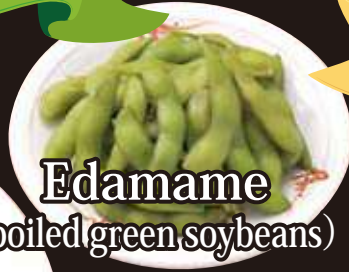
Edamame (boiled green soybeans) ¥350