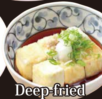
Deep-fried tofu ¥450